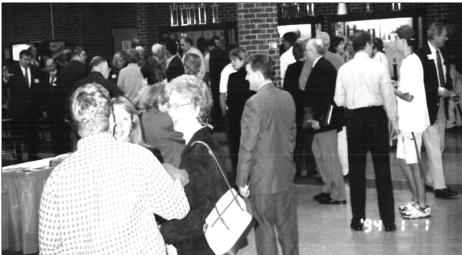
2003 Candidates Forum had record attendance, 175!!!

The Circuit Court 2004 Court Closings Calendar is included as an insert in this month's newsletter.