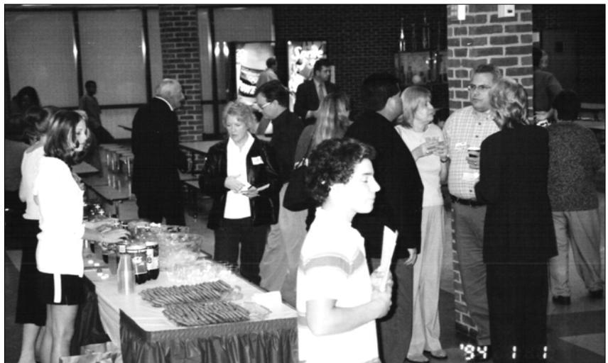
"Meet and Greet" at 2003 Candidates Forum.